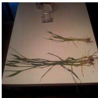
Figure 1. The effects of foliar application of PEG-sSA on wheat grown in very saline soil (area of 3 ha) in Romania during 2014. Half of the plot was sprayed four times with AB Yellow® (=4 mL/L PEG-sSA plus B, Mo and Zn). The visual differences between the sprayed plants (taller plants) and the control (small plants) can be seen.

Abbreviations: in column 'Type of trial': RCBD (randomized complete block design with at least 3 replications), ET (extension trials in cooperation with scientific institutes) and FT (farmer's trials in cooperation with scientific institutes). In the column 'Remarks' the results show the efficacy against abiotic stress (acidic and saline soil), biotic stress (decreased infection rate) and on quality, e.g., significantly higher brix, TSS, lycopene and vitamin C content (tomato), protein content (wheat) and fruit firmness (eggplant).